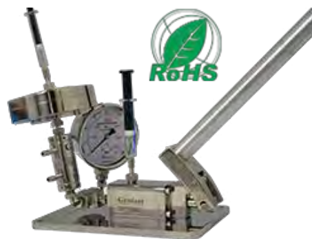
Homogenizer with Extruder