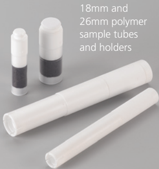
18mm and 26mm polymer sample tubes and holders

Useful for applications where there is large sample to sample variability, and also for textiles and nonwovens (using the polymer sample tubes).