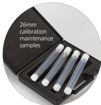
26mm calibration maintenance samples

Reusable non-glass accessories are available which are not only safe but allow easy preparation of a variety of samples, especially monofilaments and fabrics. Industry leading large volume tubes are available for more representative samples with the Advanced Package.