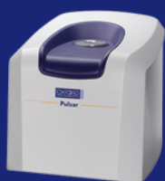
Pulsar: high resolution benchtop NMR spectrometer

This publication is the copyright of Oxford Instruments plc and provides outline information only, which (unless agreed by the company in writing) may not be used, applied or reproduced for any purpose or form part of any order or contract or regarded as the representation relating to the products or services concerned.