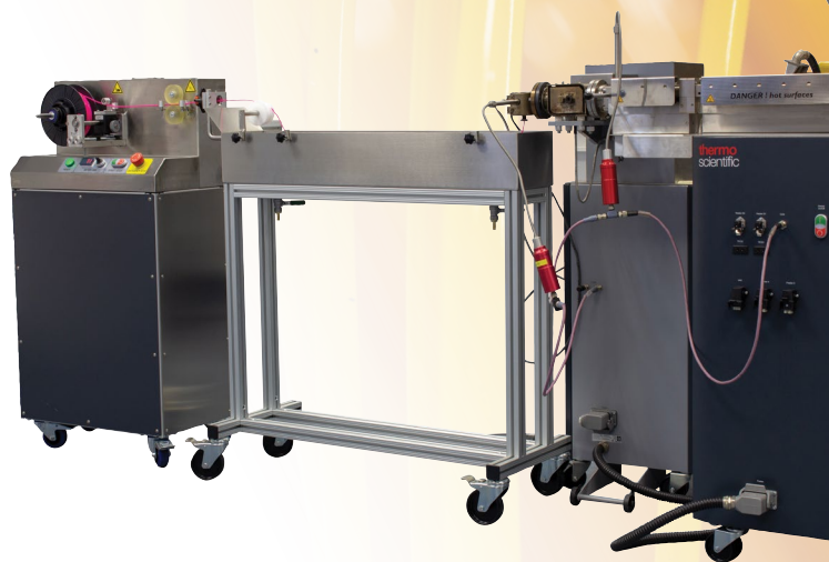
Figure 2: HAAKE PolyLab Pilot-scale 3D Filament Production System.