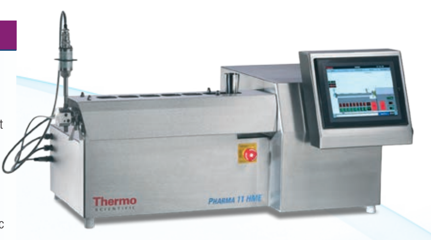
Pharma 11 Twin-Screw Extruder