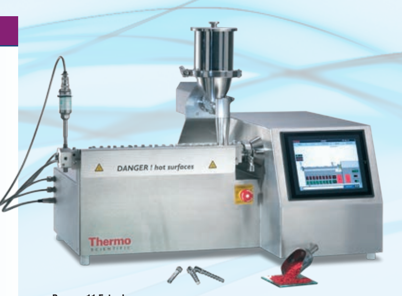
Process 11 Extruder