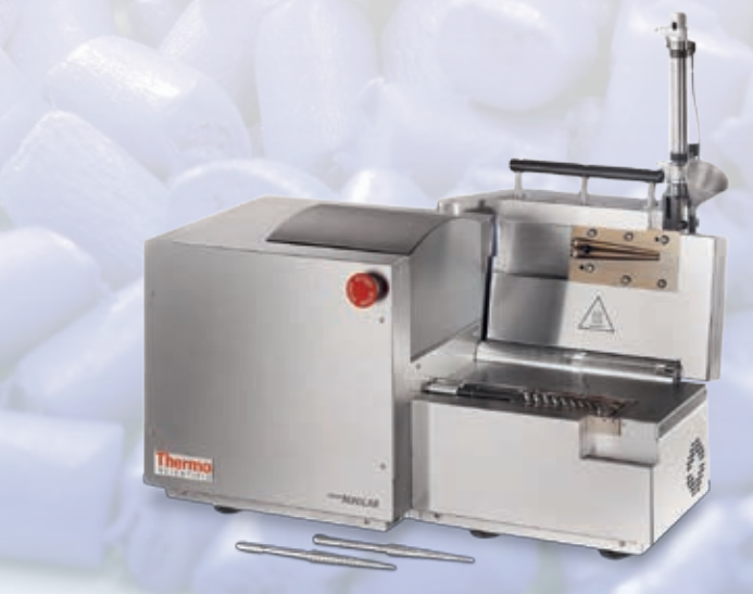
HAAKE MiniLab II Micro-Compounder